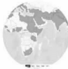
Country Historical Profiles countryhistoricalprofiles.worldbank.org