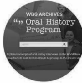
Oral History oralhistory.worldbank.org