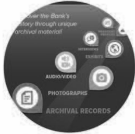
Historical Timeline timeline.worldbank.org