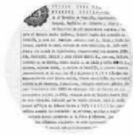
Archival Records archivesholdings.worldbank.org