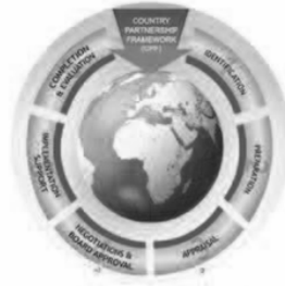
Projects & Operations worldbank.org/projects